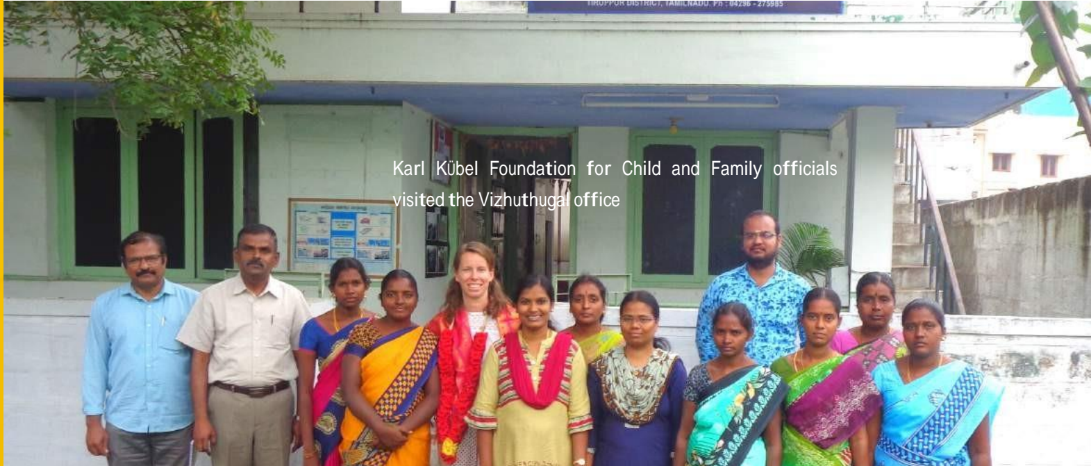
Karl Kübel Foundation for Child and Family officials visited the Vizhuthugal office

Vizhuthugal is pioneered in providing training to the spinning Mill workers in the district. Awareness on Safety measures to be taken in the working environment and taking nutritious food during the work were given by forming Internal Compliance Committee (ICC) in the mills. These ICCs were trained on their functions and oriented the workers about the existence of such forum in the mills to report any incidence of Sexual harassment at Work Place. Life skill trainings and health camps to the workers improved the physical and mental health of the workers