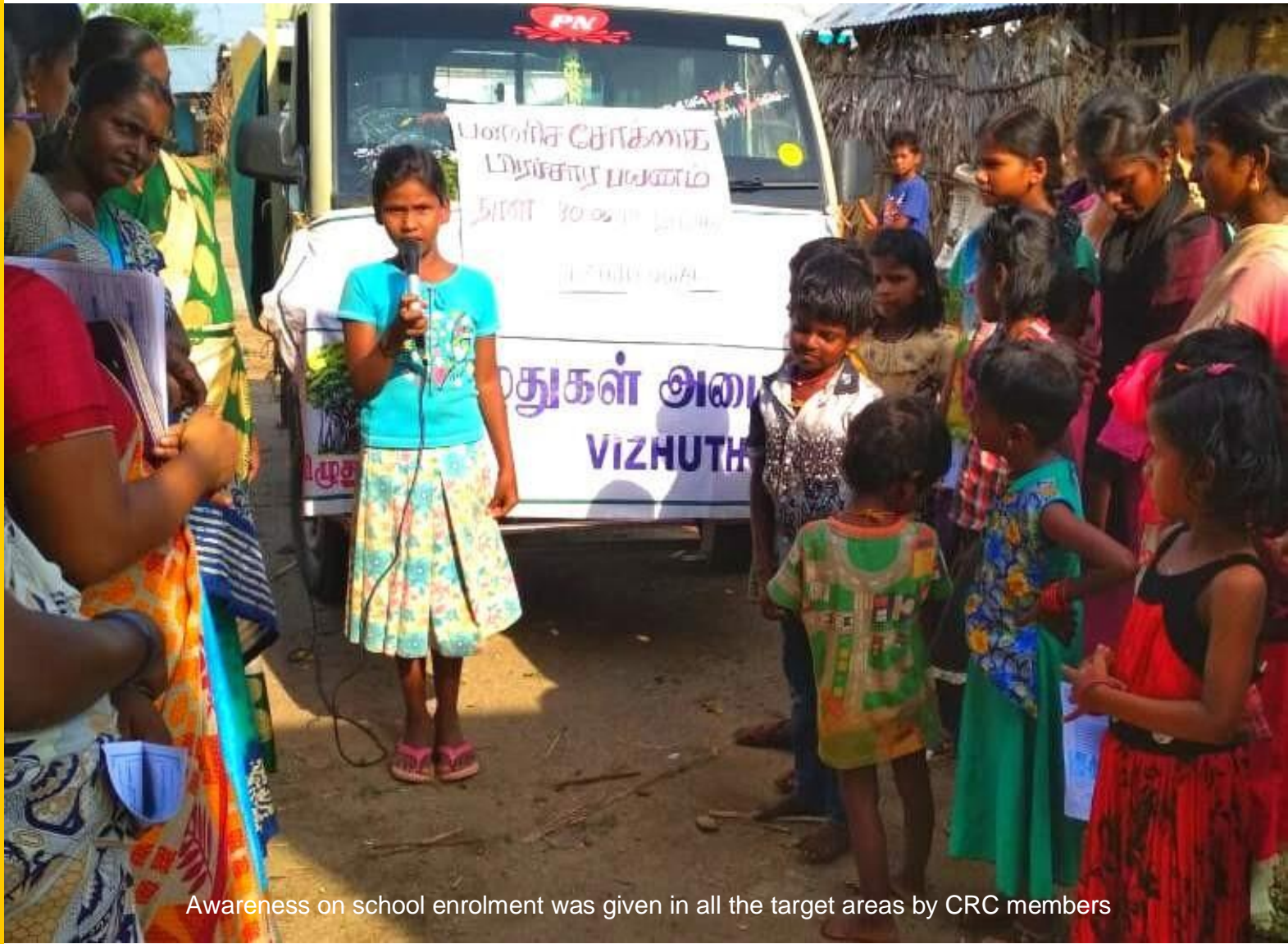
Awareness on school enrolment was given in all the target areas by CRC members